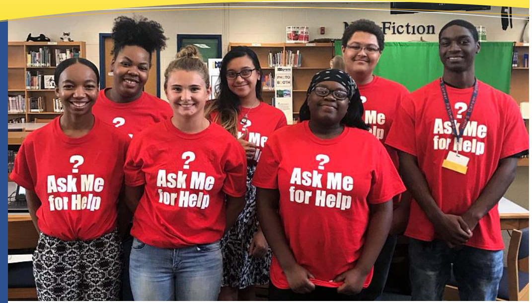
NNPS Technology summer (2018) interns exemplify the spirit of our technology department - we're here to help.